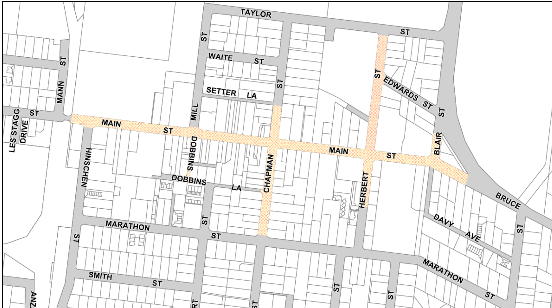
Map B – Proserpine traffic area