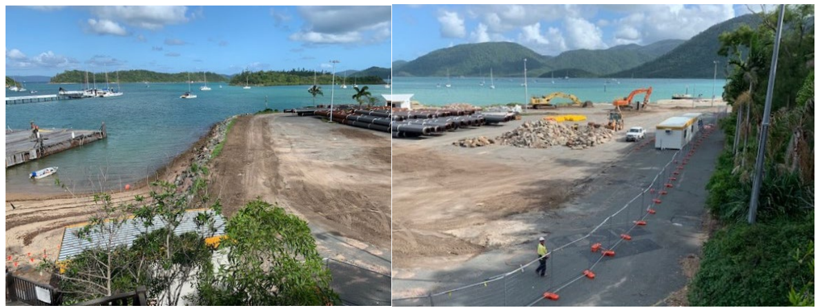
View of construction site